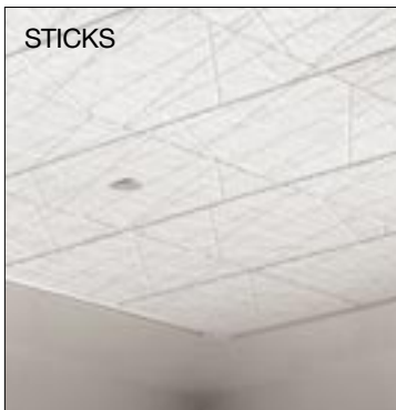
armstrong.com/ceilings (search: sticks)