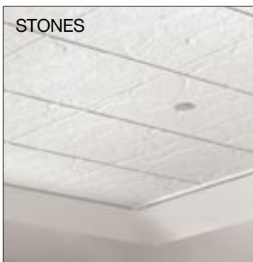
armstrong.com/ceilings (search: stones)